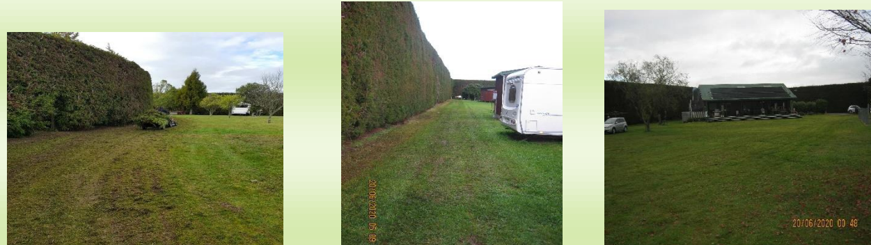
ready to dump