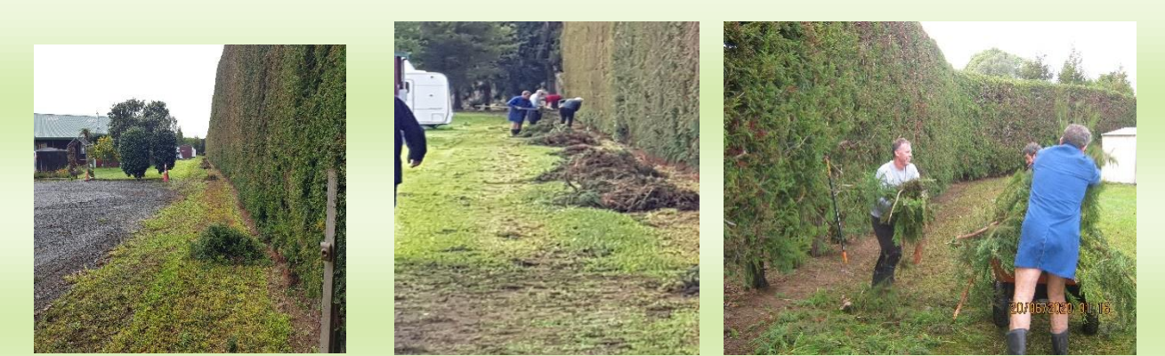
waiting to pick up